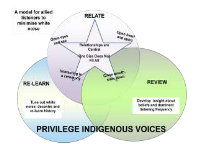
Figure 2 Listening as a critical ally (Carnes, 2011: 182)

The listening/ yarning methodology used in this research focuses on relatedness and aims to be both academically and culturally rigorous (Martin, 2008 a: foreword). Yarning is a legitimate way of collecting data in Indigenous communities; oral and aural method is the nature of teaching in Indigenous culture (Power, 2004; Bessarab & Ngandu, 2010). Importantly, 'yarning' is an informal process (Power, 2004) that relies heavily on strong relationships because "research that seeks objectivity by maintaining distance between the investigator and informants violates Aboriginal ethics of reciprocal relationship and collective validation." (Castellano, 2004: 104).