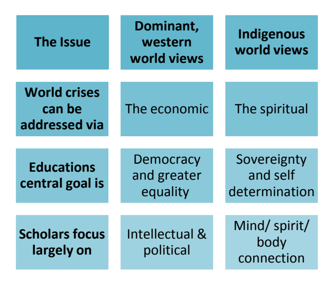
Figure 3 Potential tensions in 'white' and Indigenous approaches to education (adapted from Grande 2000: 356)